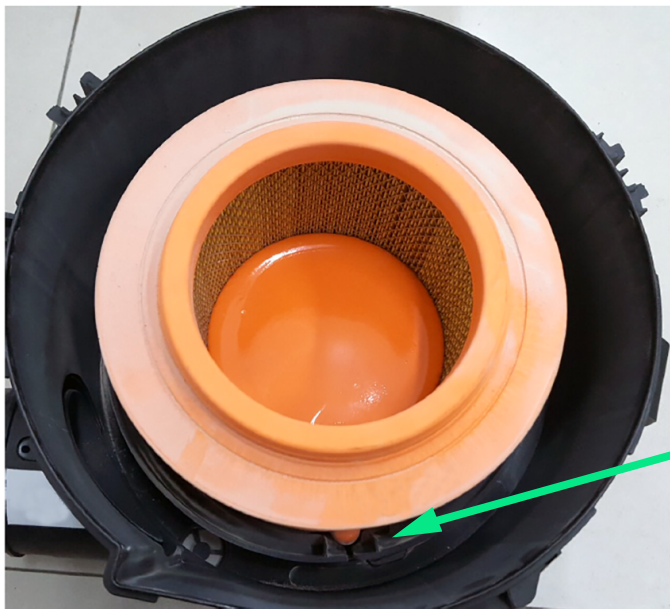
TAB IN GROOVE FITTED CORRECTLY

Make sure every time the filter is replaced that it is sitting evenly flat and that the locating tab is in the right place. Refer to images below.