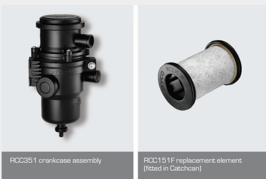
RCC351 crankcase assembly