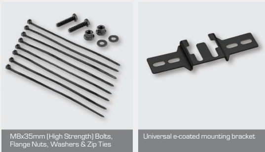
MBx35mm (High Strength) Bolts, Flange Nuts, Washers & Zip Ties